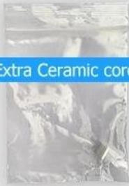
Extra Ceramic core