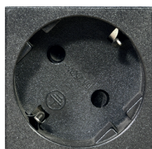
CCE 7/3 (German/Schuko)