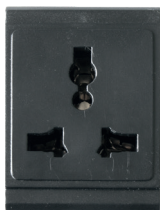
Multi Universal Type