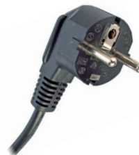
CCE 7/7-16A (German and French Schuko)