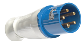
IEC-60309 3P+N+E -16A or 32A Commando Three Phase