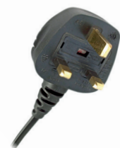
IEC-60309 1P+N+E -16A or 32A Commando Single Phase