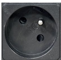
CCE 7/5 (French)